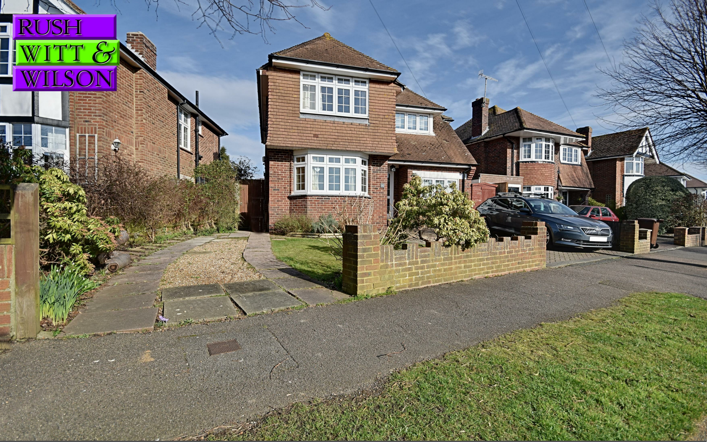
14 Glenleigh Avenue, Bexhill-On-Sea, East Sussex TN39 4EG £512,500